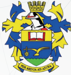
Dipaleseng Local Municipality